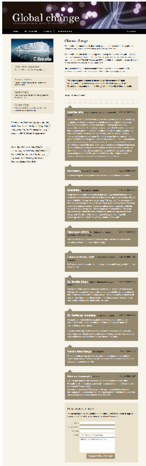
Discussion on the climate page