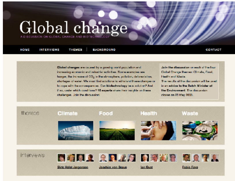
Homepage of www.globalchange-discussion.org

On April 9 2008, we have sent an invitation to participate to more than 250 stakeholders from 24 countries in Europe, of which almost one third originated from the Netherlands.